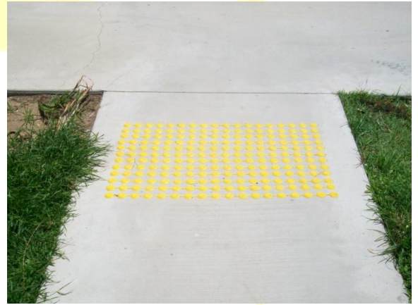
Yellow Polyblade – Ireland Motors, Mulgrave Rd